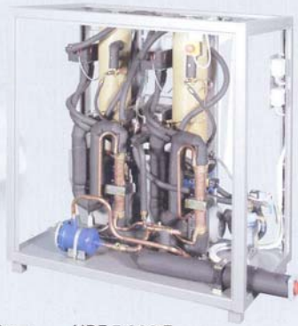
UBE 5.000 R = UBE 5.000 E