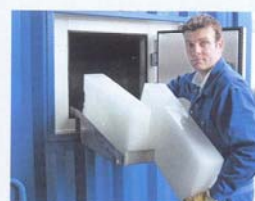
Container + Block ice