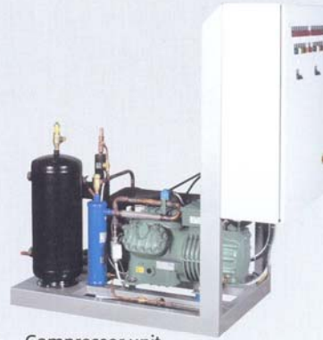
+ Compressor unit