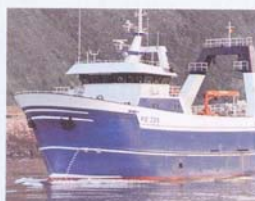
On board Machines