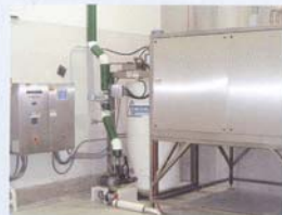
Ice Dosing Systems